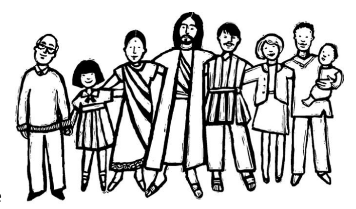
BROTHERS AND SISTERS IN CHRIST

I believe this does have an effect on us when we see it over and over. It reinforces a view of male superiority. I am not saying it is responsible for that, but it is a remnant from an age (that still exists in many ways) in which the male is more important and should be in the more dominant role. I make the subtle change in the greeting as it helps to remind me (and I hope all of us) of the equality that God has bestowed on everyone and to help me to live into it.